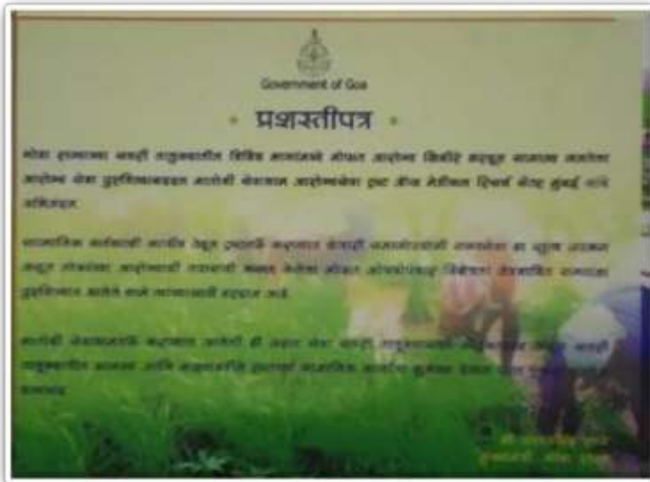
Felicitation from Goa state chief minister Pratapsingh Rane for Nobel work in Healthcare Sector.