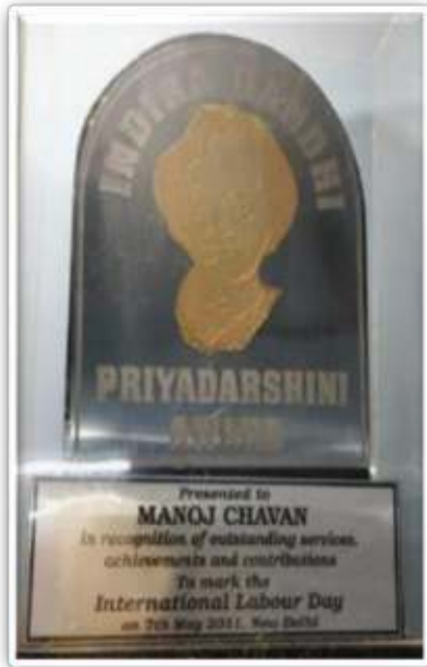
Indira Gandhi Priyadarshini Award